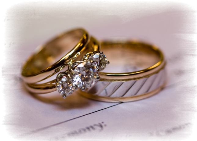
Color photo with artistic border effect