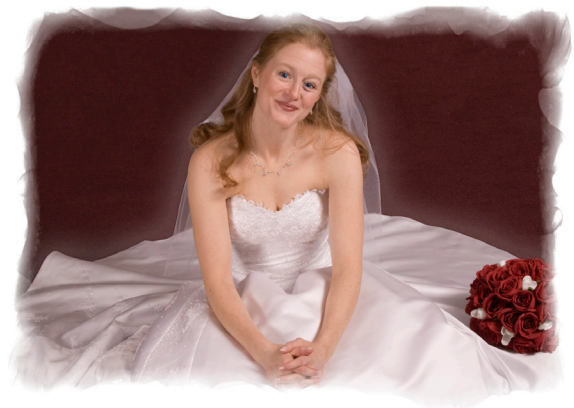
20 specialty photos are included in the Gold Package