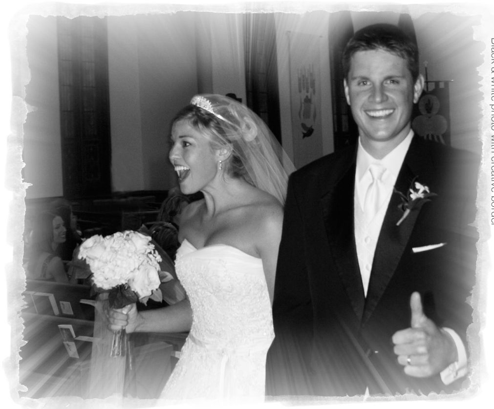
Black & white photo with creative border

Your wedding is much more than just an event – it is a celebration of the love you share and the beginning of your life as man and wife.