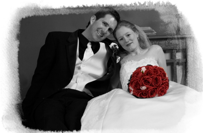
Black & white photo with color highlights and creative border